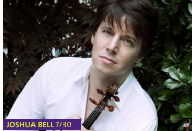
JOSHUA BELL 7/30