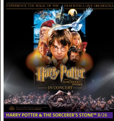
HARRY POTTER & THE SORCERER'S STONE™ 8/26