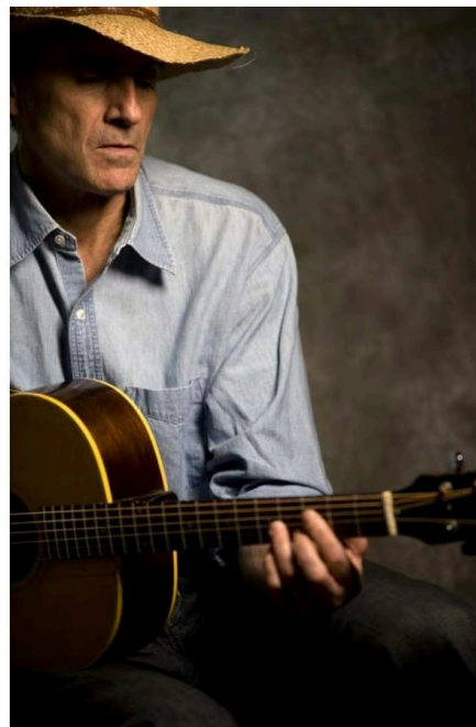
Taylor in 1974, performing for the first time at Tanglewood, and in 2024