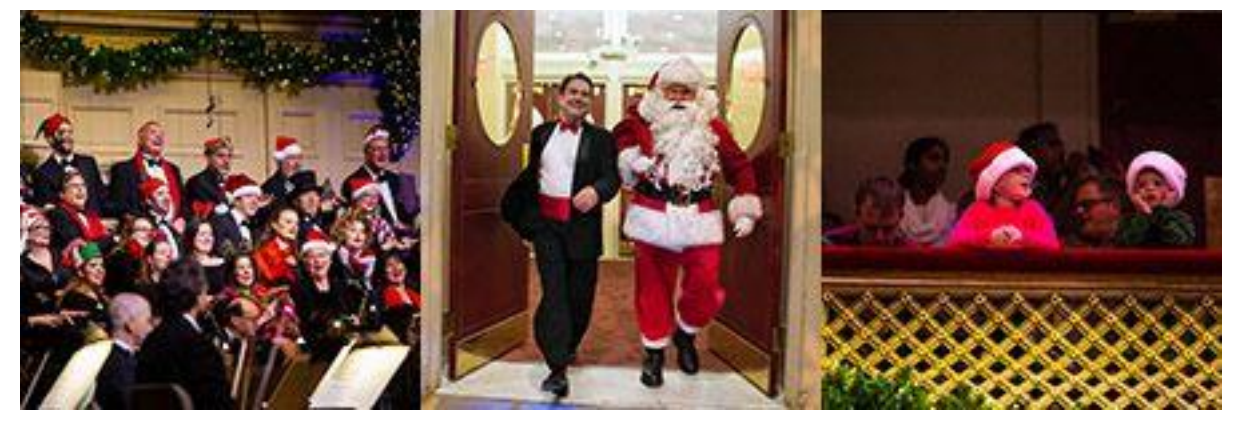
Archival Holiday Pops images; click here for high-res images

2021 HOLIDAY POPS CONCERT, UNDER THE DIRECTION OF KEITH LOCKHART, AVAILABLE AS A BSO NOW ONLINE VIDEO STREAM DECEMBER 17 THROUGH JANUARY 16