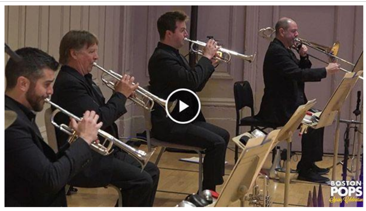
Click here to view the Pops performing the Imperial March from John Williams' score for Star Wars: The Empire Strikes Back