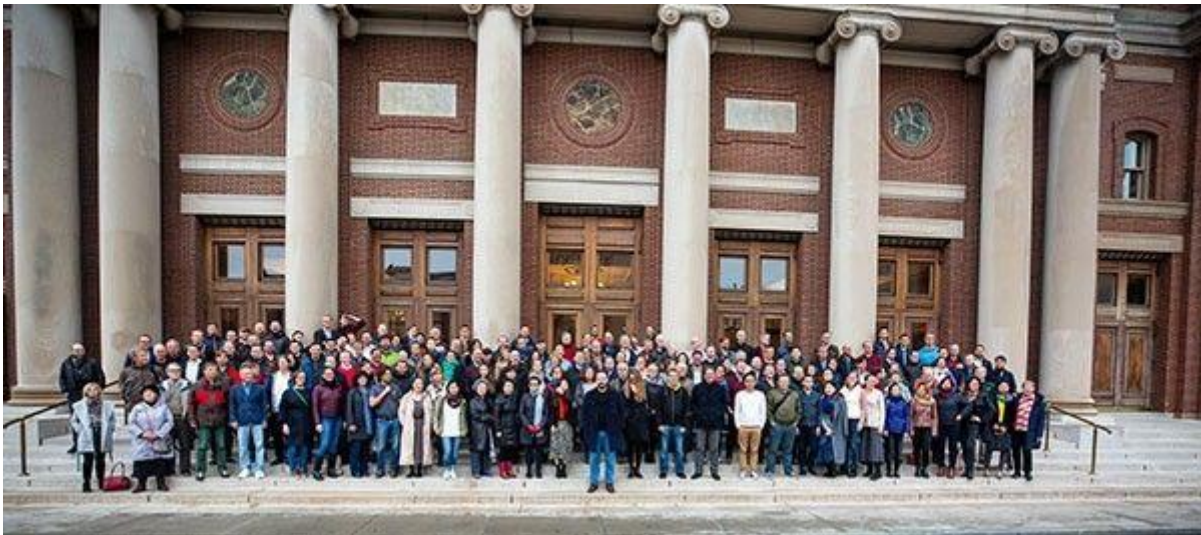
Members of the Boston Symphony Orchestra and Leipzig Gewandhausorchester with Andris Nelsons on the steps of Symphony Hall

“The Boston Symphony Orchestra and Gewandhausorchester have a wonderful relationship which has offered meaningful performance opportunities under the leadership of Andris Nelsons. The Strauss recordings shine a new spotlight on what these orchestras do together to present inspiring experiences for their music communities at home and around the world.”