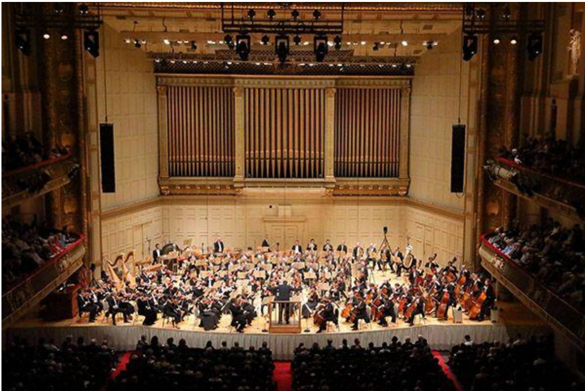
From October 31, 2019, Andris Nelsons leads a joint performance by the Boston Symphony and Gewandhausorchester of Strauss' Festival Prelude

The Strauss project pays tribute to this shared history by both celebrating each orchestra's individual connection with the composer's music and recognising the remarkable dynamic of this unique alliance.