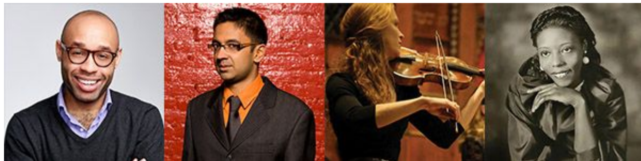
Aaron Diehl, Vijay Iyer, Apollo's Fire, Mary Lou Williams