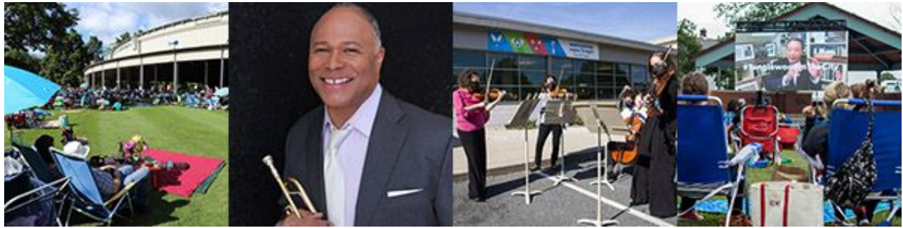
Tanglewood lawn, Byron Stripling, BSO Rolling Recital, Tanglewood in the City