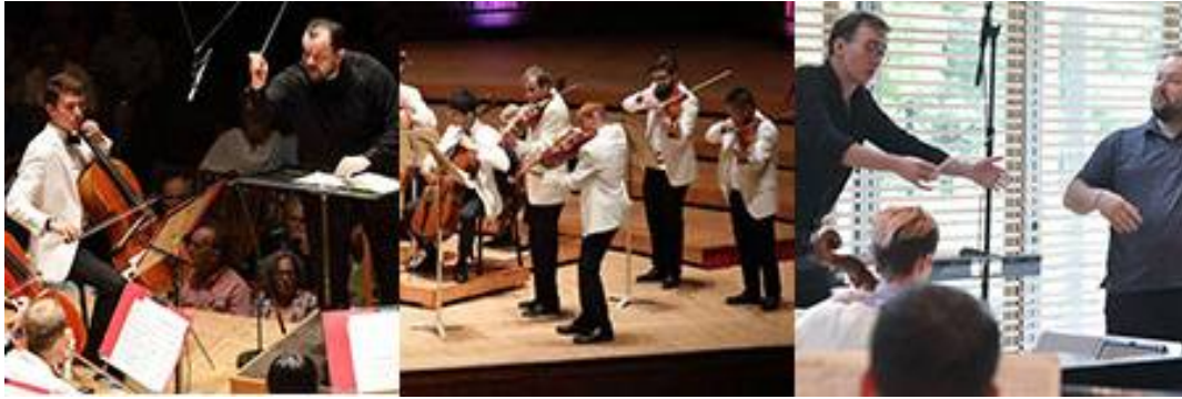
Andris Nelsons leading the TMC Orchestra, a TMC Orchestra performance, TMC master class with Andris Nelsons

NEW INFORMATION: SATURDAY, JULY 17, AT 7 P.M.: THE BSO, IN PARTNERSHIP WITH MILL TOWN CAPITAL , WILL PRESENT TANGLEWOOD IN THE CITY —A SPECIAL VIDEO PRESENTATION OF AN ARCHIVAL BOSTON SYMPHONY ORCHESTRA PERFORMANCE OF MUSIC BY JOHN HARBISON, GERSHWIN, COPLAND, AND ELLINGTON—IN THE PITTSFIELD COMMON ; KIDS 4 HARMONY AND THE EAGLES COMMUNITY BAND WILL OFFER PRE-CONCERT PERFORMANCES