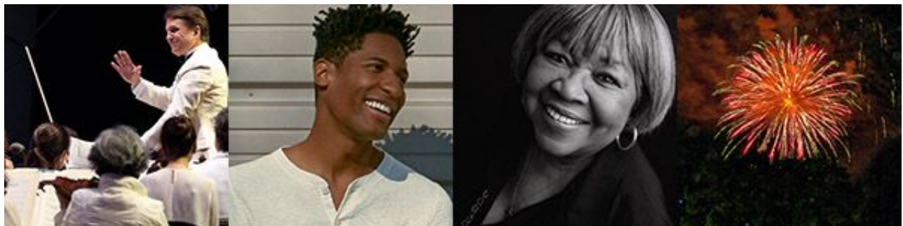
Keith Lockhart and the Boston Pops Esplanade Orchestra, Jon Batiste, Mavis Staples, Boston fireworks

PROGRAM TO FEATURE HEADLINERS JON BATISTE AND MAVIS STAPLES ON A PROGRAM OF PATRIOTIC FAVORITES, ENDING WITH THE TRADITIONAL 1812 OVERTURE PRIOR TO THE FIREWORKS DISPLAY ON THE BOSTON COMMON IN PARTNERSHIP WITH THE CITY OF BOSTON; THERE WILL BE NO FIREWORKS FOLLOWING THE CONCERT AT TANGLEWOOD