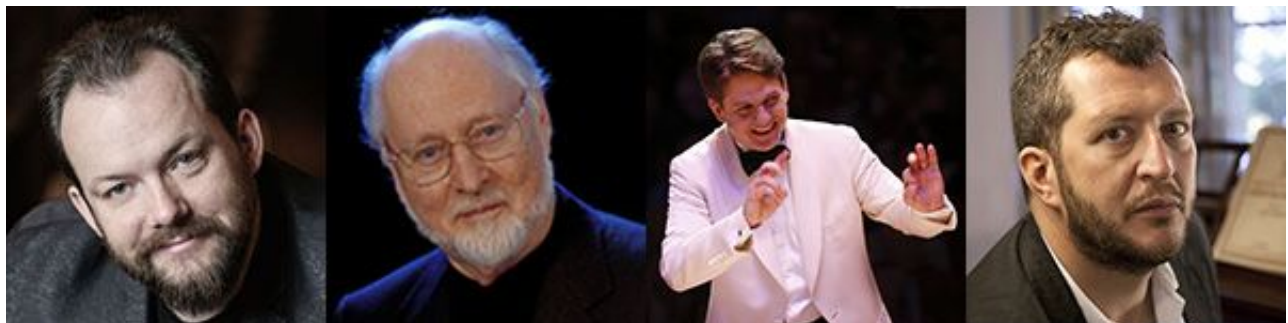
Andris Nelsons, John Williams, Keith Lockhart, Thomas Adès