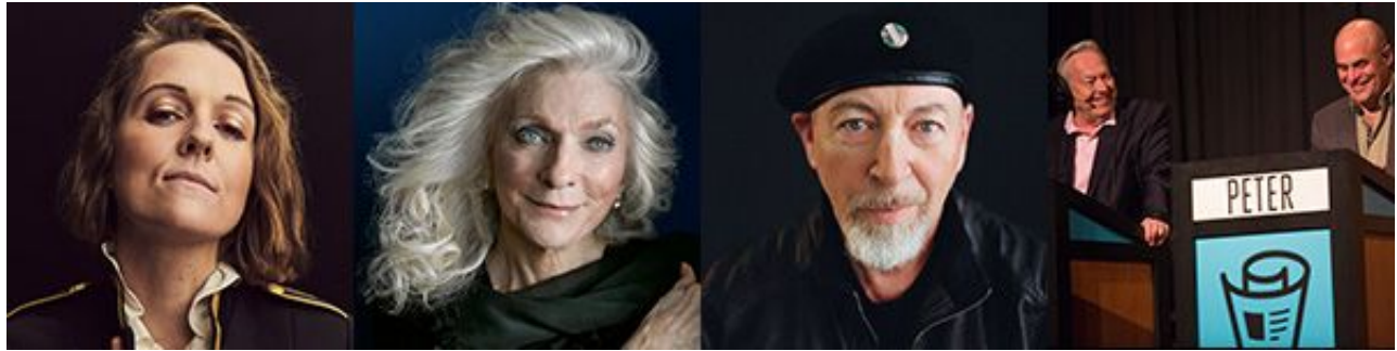
Brandi Carlile, Judy Collins and Richard Thompson, Wait, Wait ... Don't Tell Me!'s Bill Kurtis and Peter Sagal

ARTIST SERIES, INCLUDING BRANDI CARLILE, WITH OPENING ARTIST MAVIS STAPLES, ON AUGUST 21; JUDY COLLINS AND VERY SPECIAL GUESTS RICHARD THOMPSON AND JESSE COLIN YOUNG, ON AUGUST 22; AND NPR'S WAIT WAIT ... DON'T TELL ME! ON AUGUST 26