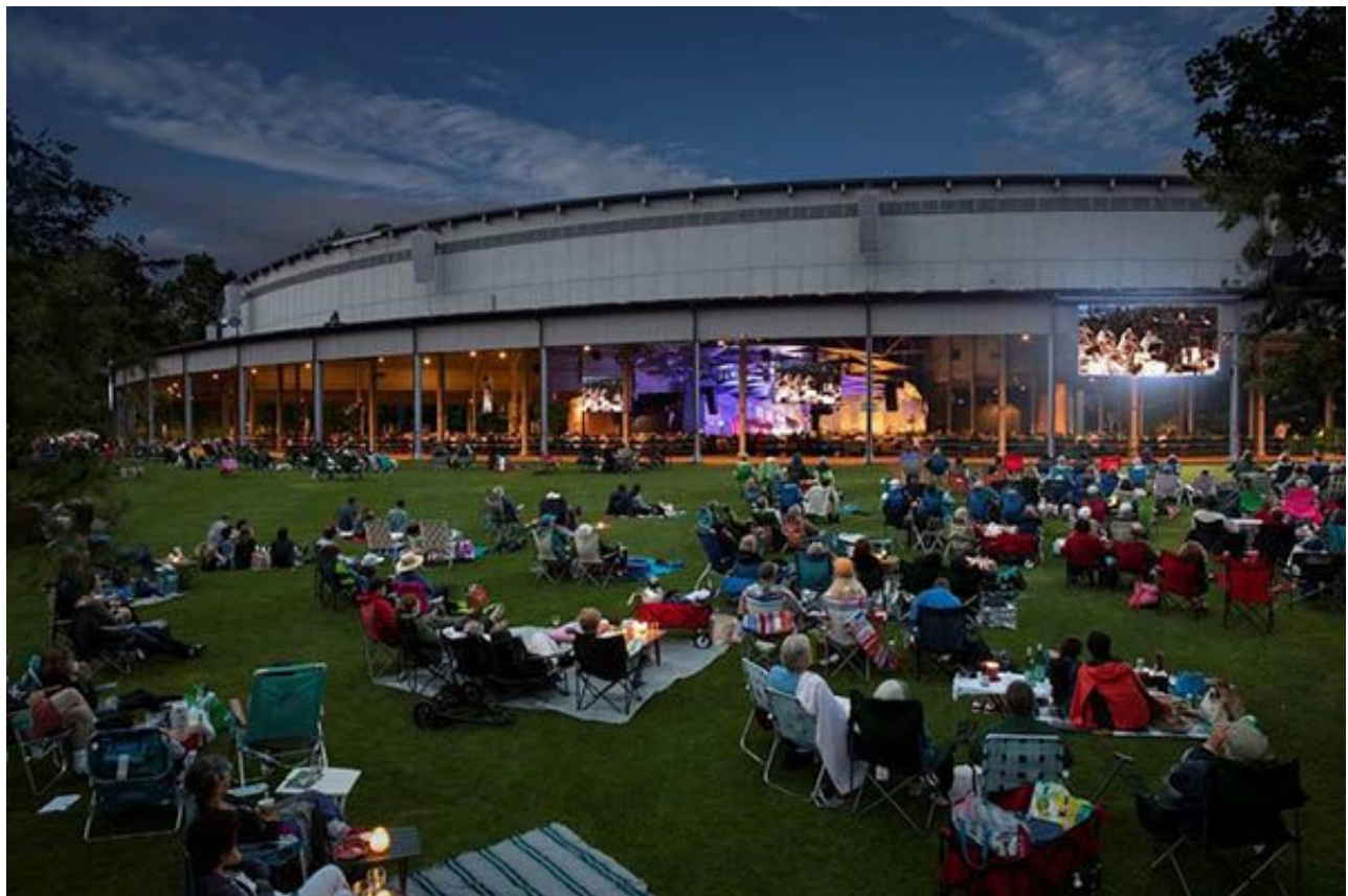
Tanglewood's Koussevitsky Music Shed, photographed in 2018 by Fred Collins; click here for high-res version